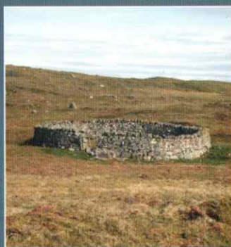
3. Sheepfold - Crò-chaorach (NC 3879 6787)

Around the south-western edge of Loch Croispol are the remains of houses and small fields where people lived and farmed more than 2,000 years ago. The houses are visible now as low circular and oval banks (like those at NC 3878 6785 and 3881 6782) that supported timber or turf walls, with a cone-shaped roof resting on a ring of posts around the hearth inside. A system of small fields extends northward from the roundhouse at NC 3877 6791, defined by stony banks and clearance cairns, created when stones were cleared to make way for cultivation.