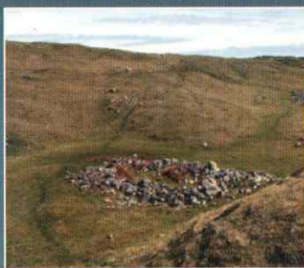
4. Farmstead - Tuathanas (NC 3871 6791)

The remains of a small farmstead are nestled in a narrow, sheltered valley to the west of Loch Croispol and the areas of prehistoric settlement. You can see the tumbled stone remains of a house, with associated dykes and clearance cairns. This was probably occupied during the 18th century, before the area was cleared for sheep.