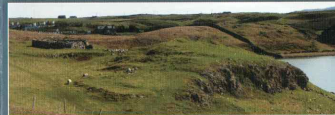
8. Loch Borralie dun and township - Baile is Dùn Loch Bhoralaidh (NC 3841 6752)

An enigmatic structure is tucked into the quarried face of a rocky outcrop at the mouth of Hakon's Bowl. It is defined by a stone-and-turf wall base with several upright stones. It could be a prehistoric house or a later shelter or enclosure. You can see remnants of ancient hazel woodland growing among the surrounding outcrops.