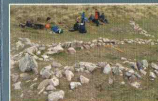
9. Loch Borralie medieval houses - Taighean meadhan-aoiseil Loch Bhoralaidh

Keep to the slope above the loch shore to climb to this site on a prominent knoll overlooking Loch Borralie. You'll find an intriguing complex of buildings. The earliest is a defended homestead, visible as a pronounced circular mound ringed by a bank on the south and west, perched above the steep slope that leads down to the loch. This was probably occupied during the mid first millennium AD, and when Norse speakers arrived in the area they named it 'Borralie' after this fort (or 'borg'). A small township was built around the homestead, with several long, rectangular houses and yards. They were probably constructed using stones from the homestead, and one was dug into its south-west flank. Finally, after the inhabitants of Borralie township were evicted in the early 19th century, a sheepfold was built in its midst.