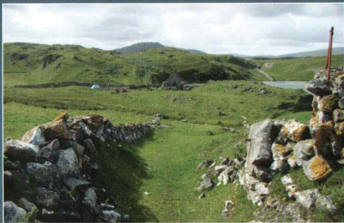
1. Croispol schoolhouse - Taigh-sgoile Chroispal (NC 3908 6769)

At the south-east edge of Loch Croispol stands a schoolhouse that was the parish school from about 1760 to 1861. At the top of the track leading down to the schoolhouse from the north-east you'll find a display board where you can read about its unusual history, and the evidence that excavation found for its use, alteration and collapse.