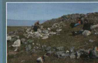
10. Loch Borralie burial cairns - Cùirn tiodhlacaidh Loch Bhoralaidh (NC 3790 6761)

From site 8, go through the gate at the loch side and then climb the slope diagonally towards the forestry plantation. Along the western side of Loch Borralie are two settlements dating from the 1400s. One (at NC 3807 6745) sits within a large fenced enclosure and is being investigated by archaeologists; the excavation trench outline is marked out with stones, and later (18th-century) buildings sit partly over it. The other (at NC 3780 6717) sits high above the loch in a hollow, with stone walls defining a small yard and a field beside it.