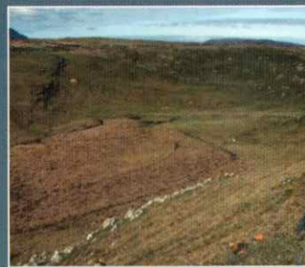
6. Hakon's Bowl prehistoric house - Taigh aosmhor Chuach Acain (NC 3850 6780)

At the northern edge of the natural amphitheatre known as Hakon's Bowl (after a Norwegian king who was said to have sheltered here) are the remains of a large prehistoric house. It is visible as a substantial circular bank, with a low curving bank outside it on the north-east that was probably an associated yard (to the right in the photo). The house once stood on the shore of a loch, evident now in the thick, soft peat covering the floor of the Bowl.