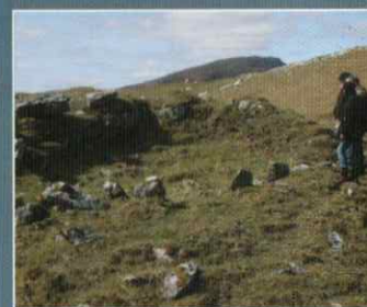
7. Hakon's Bowl mystery building - Togalach neo-aithnichte Chuach Acain (NC 3857 6767)

At the northern edge of the natural amphitheatre known as Hakon's Bowl (after a Norwegian king who was said to have sheltered here) are the remains of a large prehistoric house. It is visible as a substantial circular bank, with a low curving bank outside it on the north-east that was probably an associated yard (to the right in the photo). The house once stood on the shore of a loch, evident now in the thick, soft peat covering the floor of the Bowl.